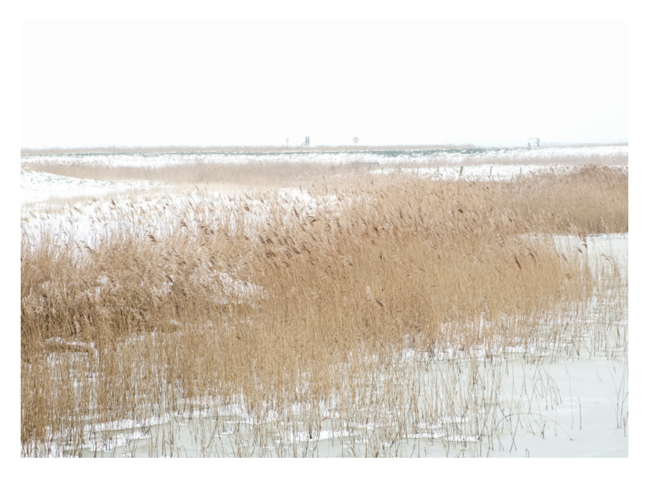
A slightly more quirky photo of still more reeds is featured below. I particularly like the reeds at the front of the frame of this photo. It reminds me of a pencil sketch.