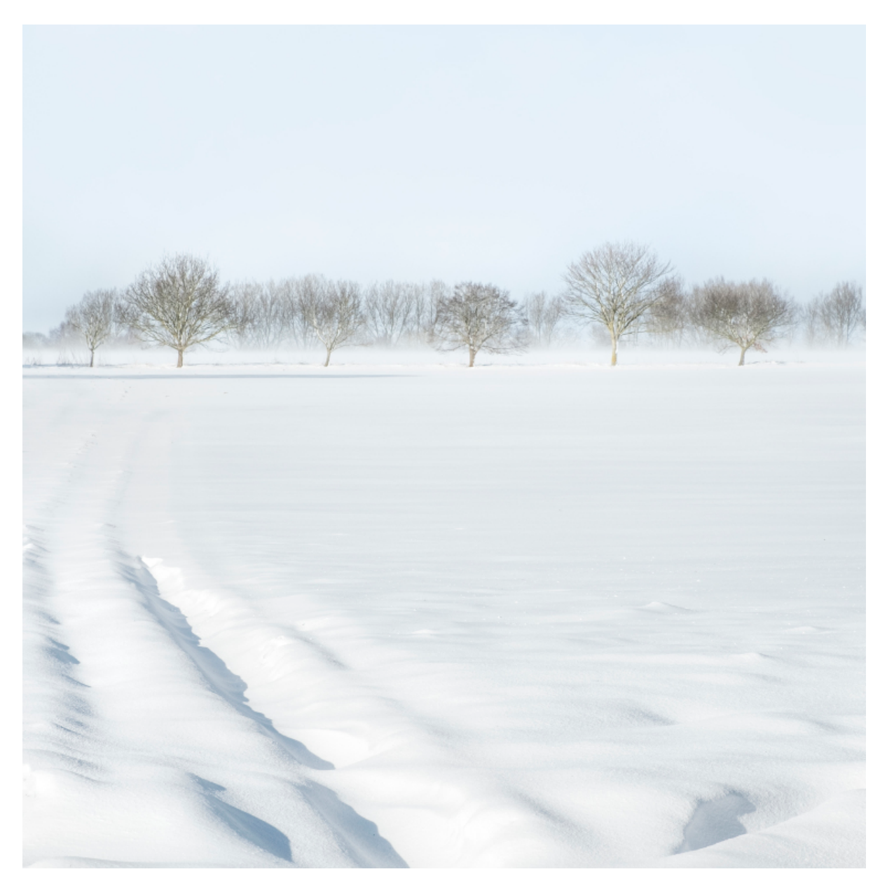
During March and April I spent a lot of time out and about locally. I return again and again to some spots on The Broads and in North Norfolk as the conditions vary widely which allows me to really get to know the area and work within it accordingly.