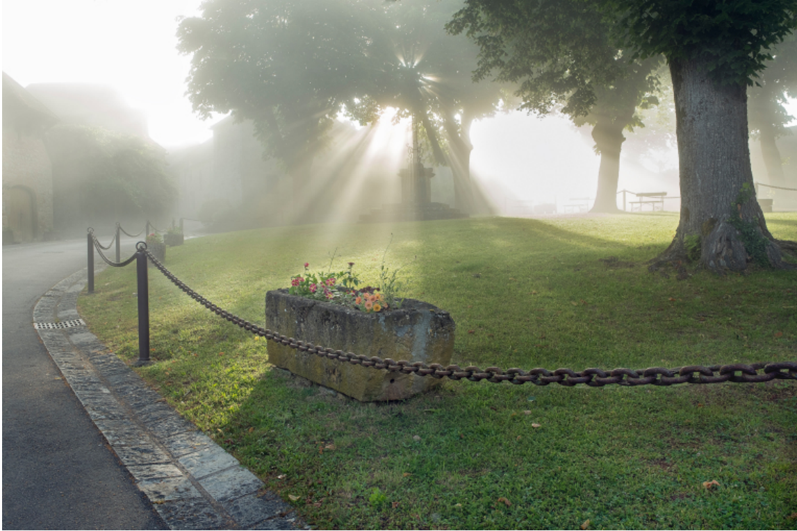
Mists in loubressac

I was also lucky to visit a friend and her husband who are now living in the beautiful and understated area of France known as Correz. Few cars and few people make this area a joy to explore. Perfect French markets towns are surrounded by large areas of countryside and farmland. It was a change to shoot photos in shorts and a t- shirt, but one that was a welcome change!